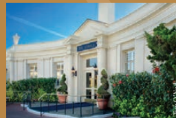
THE LODGE AT PEBBLE BEACH