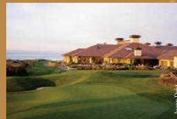
THE INN AT SPANISH BAY