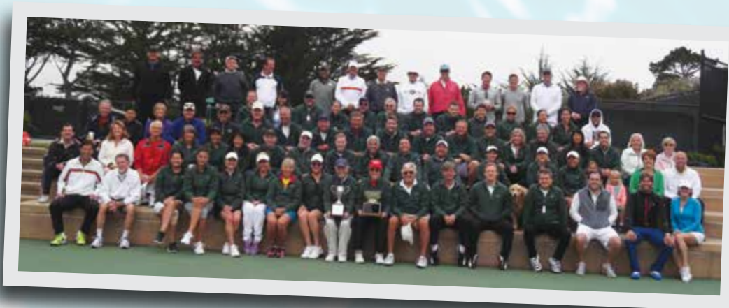
Don Bering Cup 2014