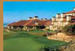
THE INN AT SPANISH BAY