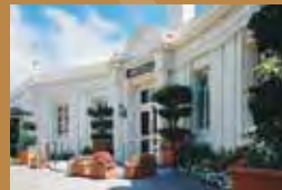
THE LODGE AT PEBBLE BEACH

RESORT RESERVATIONS: 800-654-9300 or www.pebblebeach.com The Lodge at Pebble Beach, Casa Palmero or The Inn at Spanish Bay